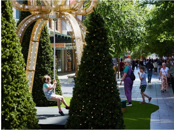
Christmas & Boxing Day in Rundle Mall

AEDA and City of Adelaide combined resources to deliver a new decorative, interactive city-wide experience called 'The Santa Course'. Nine giant inflatable illuminated, and bespoke Santa's were placed around the city, with 3 being located in Rundle Mall. Complementing the Santa Course in the Mall was the Santa Course Christmas trail, street entertainment and performances (including Australia Girls Choir and the Adelaide Symphony Orchestra) and extended Christmas trading hours.