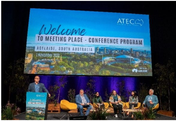
Australian Tourism Export Council

AEDA sponsored the Australian Tourism Export Council's 'Meeting Place' trade event in October. AEDA attended 24 business to business trade engagement appointments and break-out sessions. These appointments were with tourism product providers and tourism operators, which provided the opportunity to showcase the city as a Tourism destination and promote AEDA's roles in the city's visitor economy.