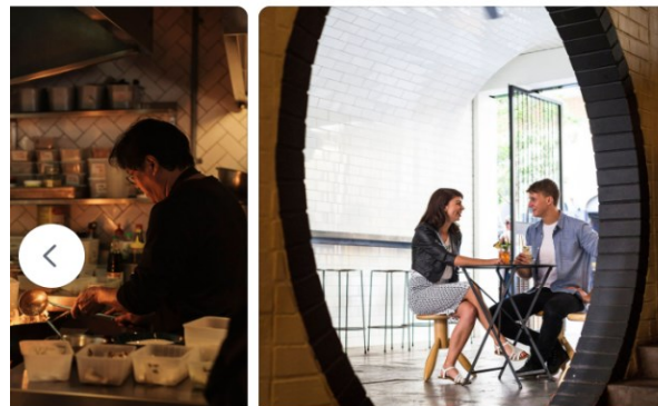
Co-op Campaign with SATC

75% of participating businesses believed the trail was helpful in promoting their business and attracting more visitors to the city, and 100% wanted to be involved in future city trail initiatives. AGSA exceeded their target of 60,000 visitors, reaching 80,000.