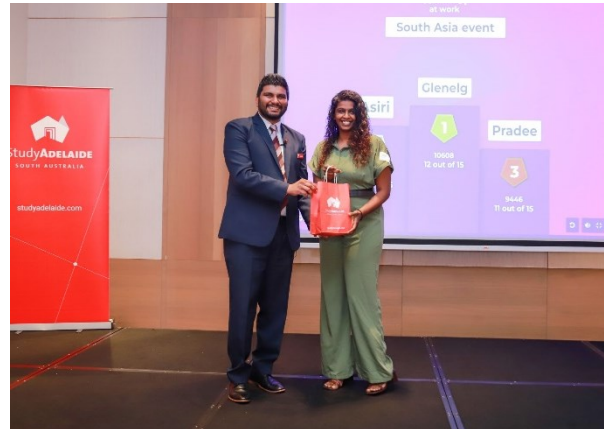
Strategic Partnership Program

Rundle Mall Foot traffic over the weekend was up 9.7% on AFW 2022 weekend and market share was 6.1% up on benchmark for Oct 5.2%