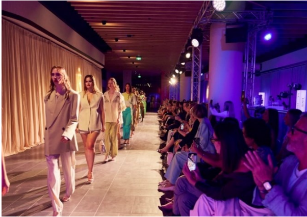
ADL Fashion Week

The second ADL Fashion Week was held Friday 20 to Sunday 22 October 2023 with 33 events and 80 additional fashion-related experiences or offers. Tickets across AFW events reached 87.6% of capacity (1,720 / 1,964 tickets).